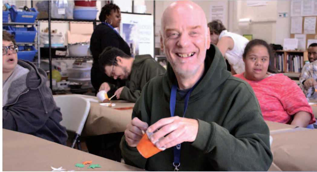
Part of the momentum of FY24 was the ability to get more and more participants out on community trips to give them increased exposure to activities that stimulate their growth.

One bit of good news was the fact that contributions to KSI increased from FY23 to FY24.