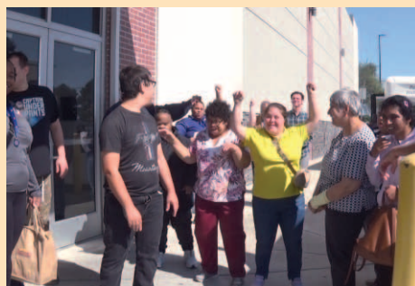
A group of participants get excited lining up for a movie in Milford.

deviled eggs that were part of their ample lunch. And they also were able to work on their social skills together in the process.