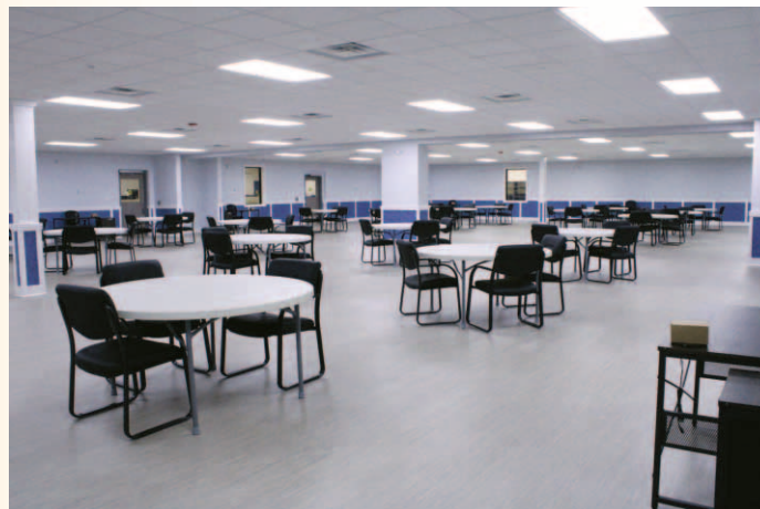
Reworking program spaces is just part of KSI’s three-year priorities.

• Integrity —promoting a culture of trust, openness